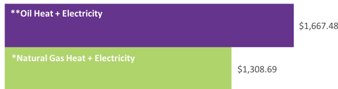
Projected Winter Period Utility Cost Comparison for the period of October 2017 to March 2018

*Data based on average residential consumption & actual/projected WG+E pricing for the period